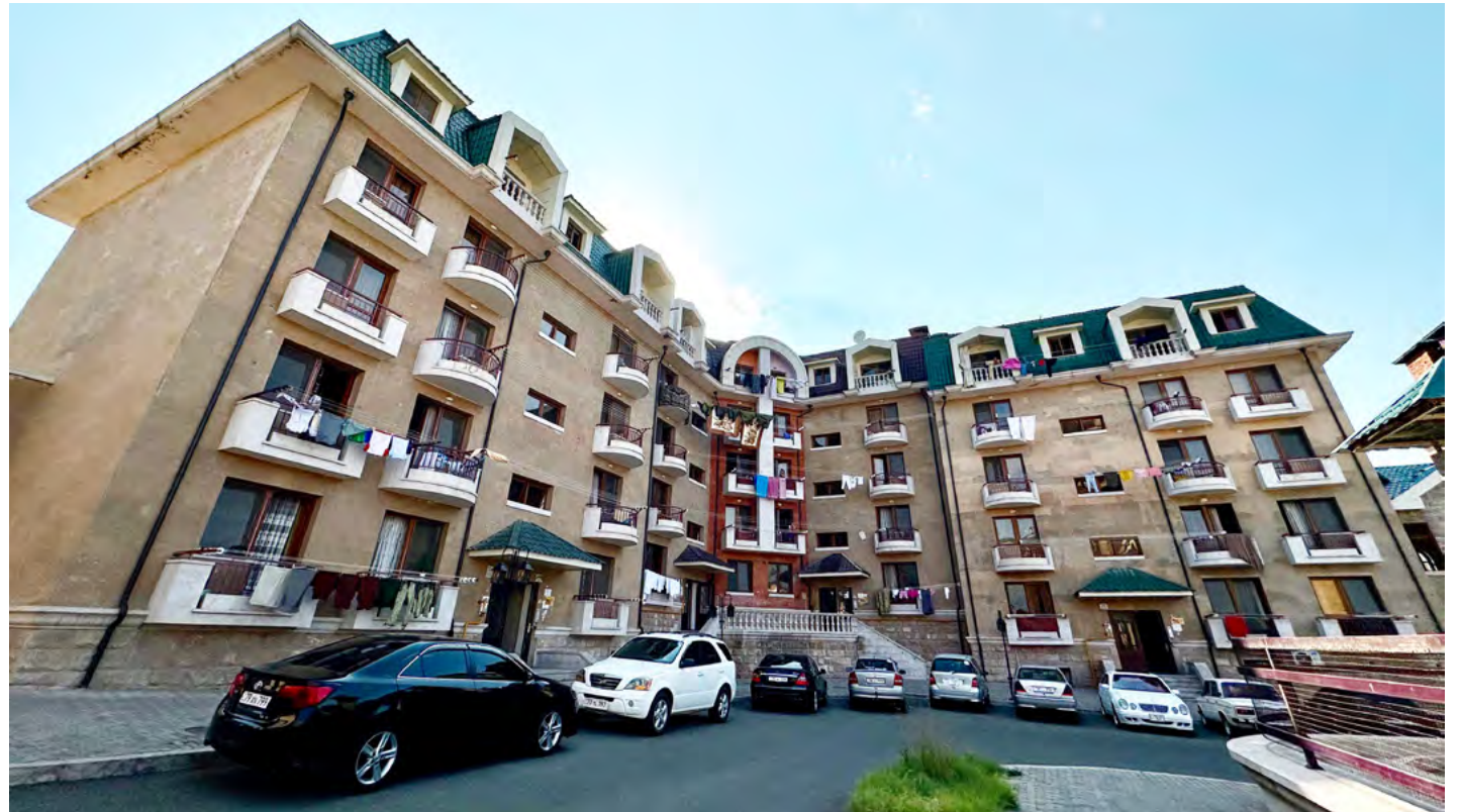
The “Artsakh” neighborhood in Stepanakert. People worked and waited for years to get an apartment here, but unfortunately very few succeeded in living there. Azerbaijan has converted these apartments into student dormitories. September 2023

The Armenian government offers more money for purchasing an apartment in border settlements, 5,000,000 drams ($13,497) per person, than elsewhere, but the majority of Karabakh Armenians have settled in Yerevan and neighboring settlements. They mainly explain this in terms of ease in finding jobs. The provinces are more rural and often offer fewer jobs.