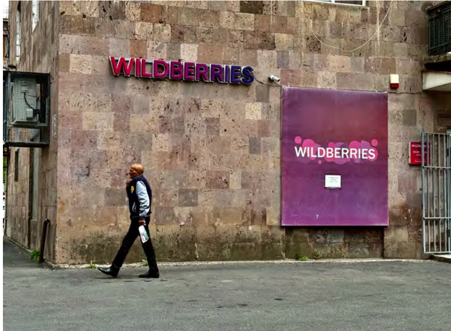
Wildberries delivery point in Yerevan

A political subtext is perceived in Armenia, where people are voicing opinions that Russia has begun punishing Armenia on the eve of the 8th European Political Community Summit which takes place in Yerevan.