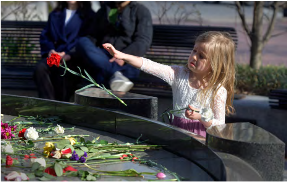
A young girl puts a flower on the abstract monument at the Armenian Heritage Park