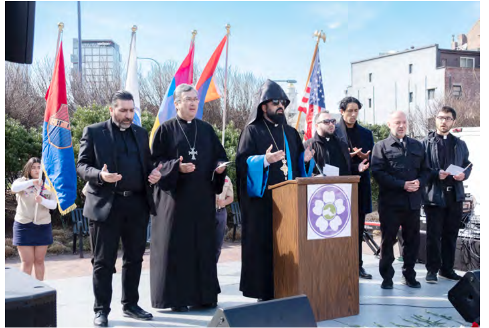
Members of the clergy at the Armenian Heritage Park

by Azerbaijan’s Turkey-backed forces and yet, both sides were guilty of the crisis. The Azerbaijani government assured us that it will be safe and we can live together peacefully. I did not believe them. We did not believe them. We all got forcefully