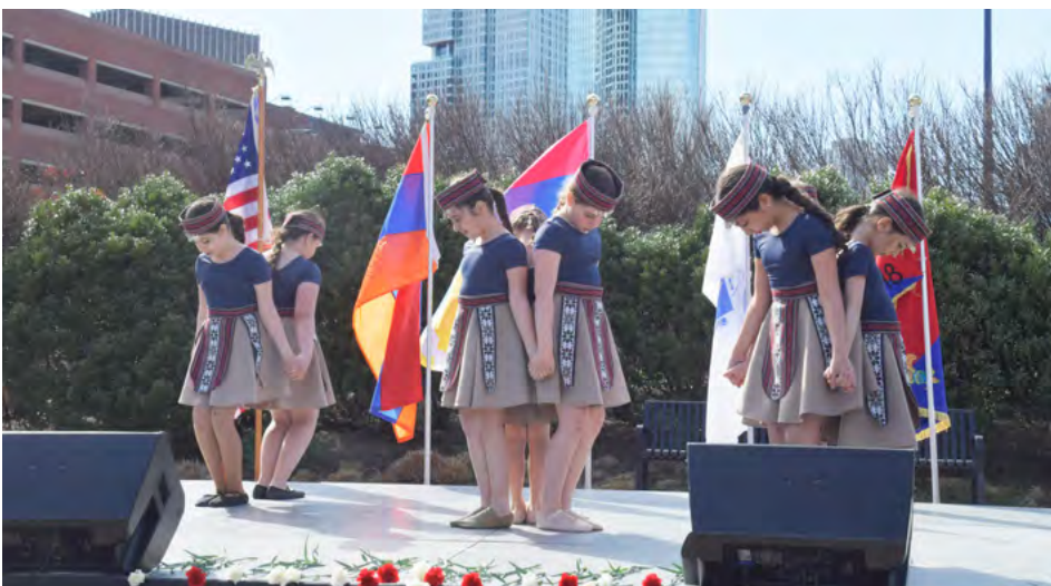
Dancers from the Armenia Dance Studios