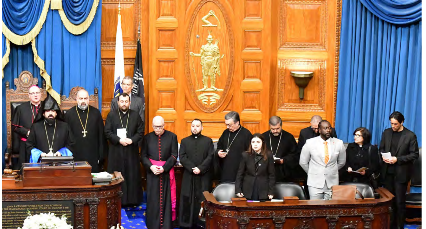
The clergy at the Massachusetts State House