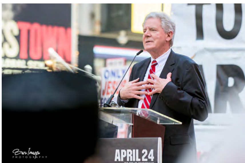
New Jersey Congressman Rep. Frank Pallone

Archbishop Anoushavan Tanielian gave the invocation, highlighting the significance of the Times Square Commemoration: "There has been no end to such see TIMES SQUARE, page 11