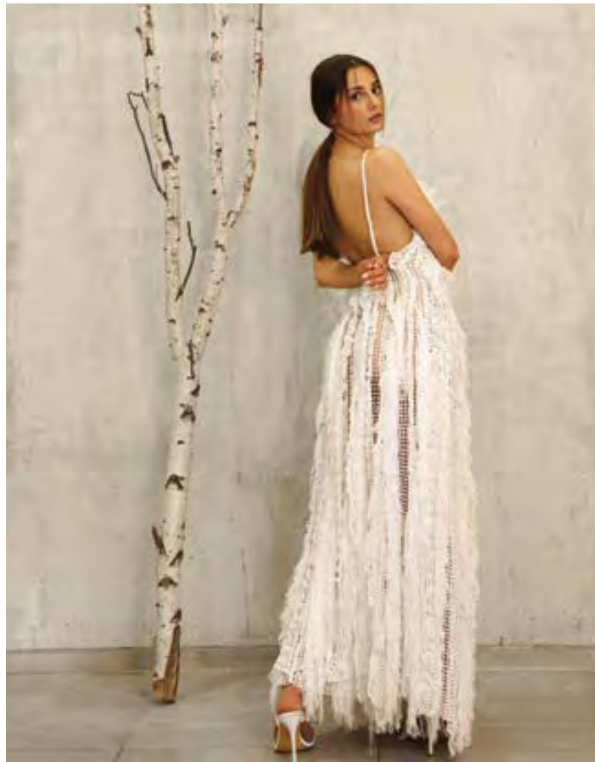
Dress by LOOM Weaving