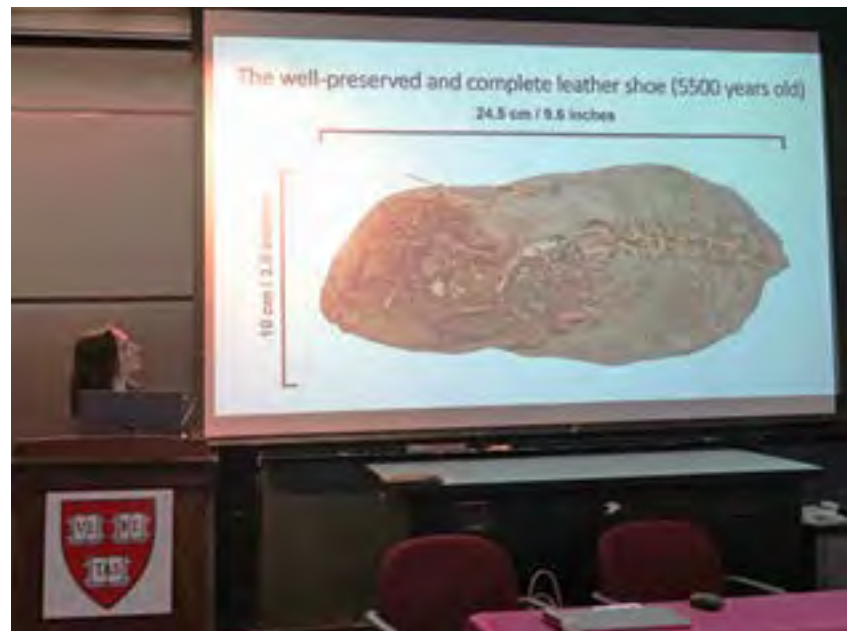
Ani Adigoyzalyan with a slide of the famous ancient leather shoe at her Cambridge talk