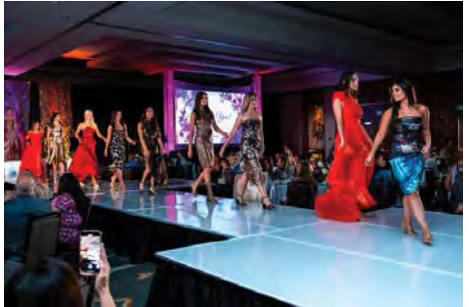
Fashion Show Models