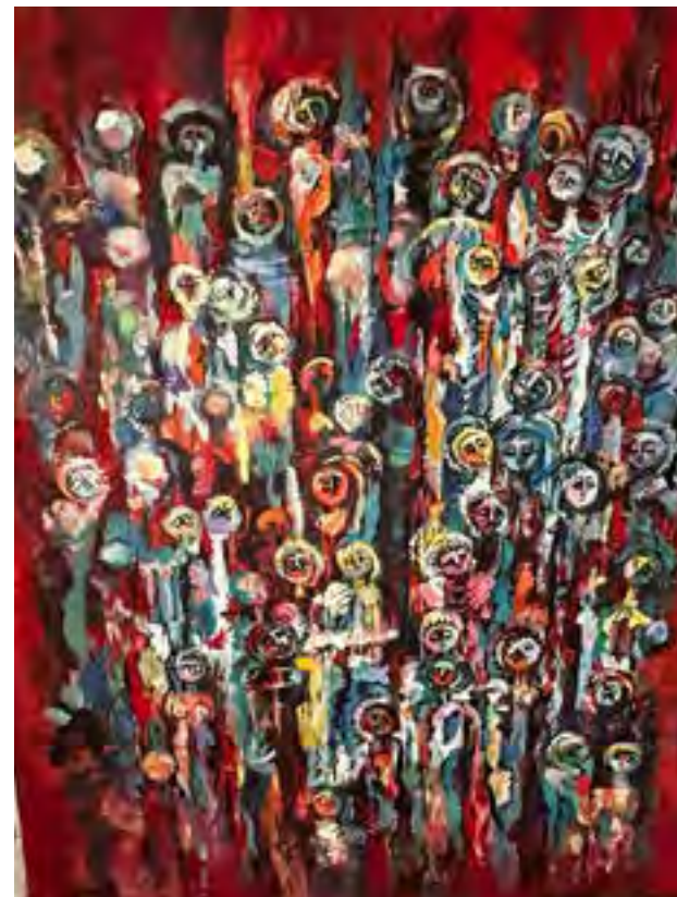
Bread line during Artsakh's blockade