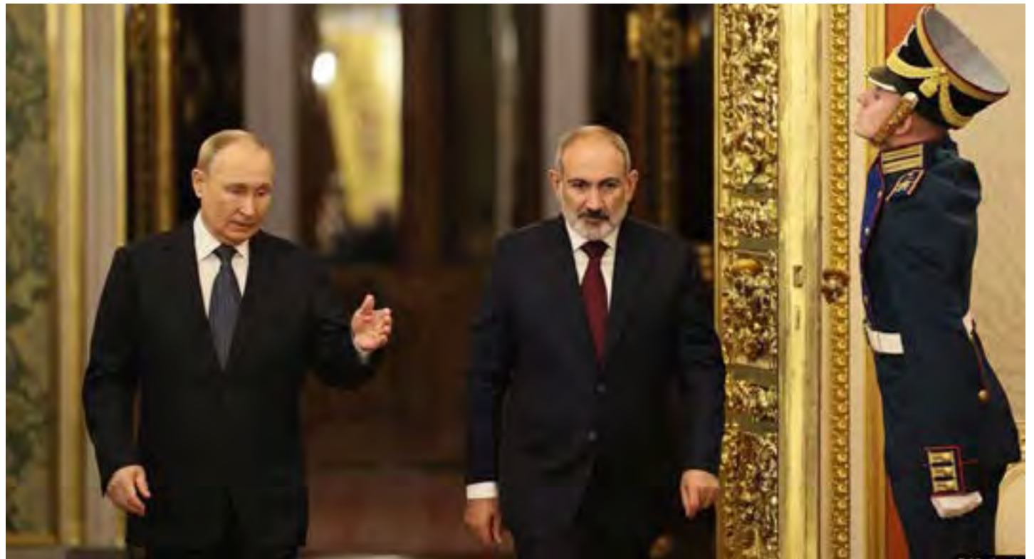
Russian President Vladimir Putin meets with Armenian Prime Minister Pashinyan, Moscow, October 8, 2024.

"The United States and its satellites are trying to expand sanctions in the form of so-called secondary and tertiary illegal sanctions [against third states]," he said. "We know how to counter that criminal activity."