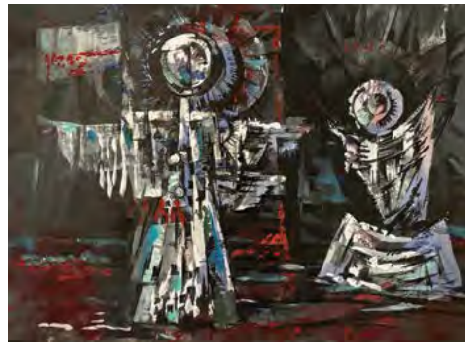
Sad dance of Girls.