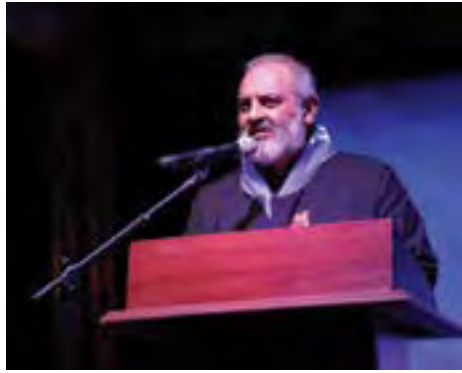
Archbishop Bagrat Galstanyan in Yerevan on October 6.

Holy Struggle, formerly the Tavush for the Motherland movement, was founded