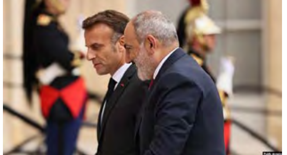
French President Emmanuel Macron meets with Armenian Prime Minister Nikol Pashinyan, Paris, October 3, 2024.

then French Foreign Minister Stephane Sejourne defended France's deepening military ties with Armenia. He also urged Baku to reciprocate Yerevan's desire to promptly sign the peace deal.