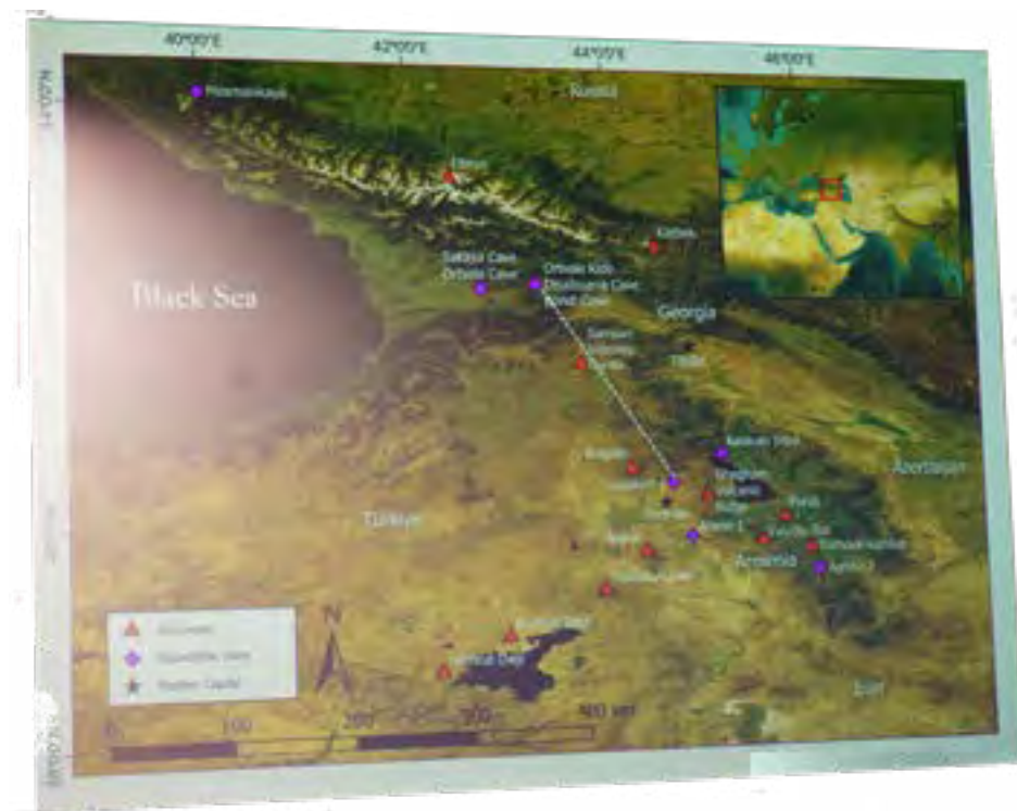
Map slide from Daniel Adler's lecture indicating locations of Lusakert-1 and Ortvale Klde

Adler's talk focused on the site of Ortvale Klde in Imeretia, western Georgia, containing archaeological evidence from the period ca. 60,000-21,000 BCE, and Lusakert-1 Cave, from ca. 65,000-45,000