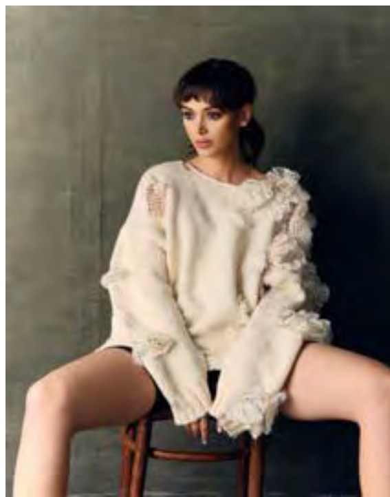
Loom Weaving sweater