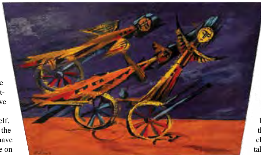
Traveling to Paris