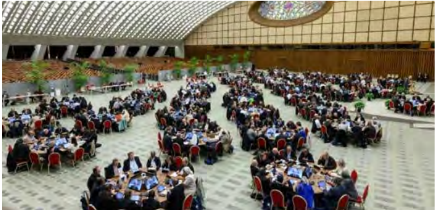
A scene from the assembly

Pope Francis’ vision for this synodal Church centers on greater collaboration between bishops and laypeople, drawing from the teachings of the Second Vatican Council and seeking to address