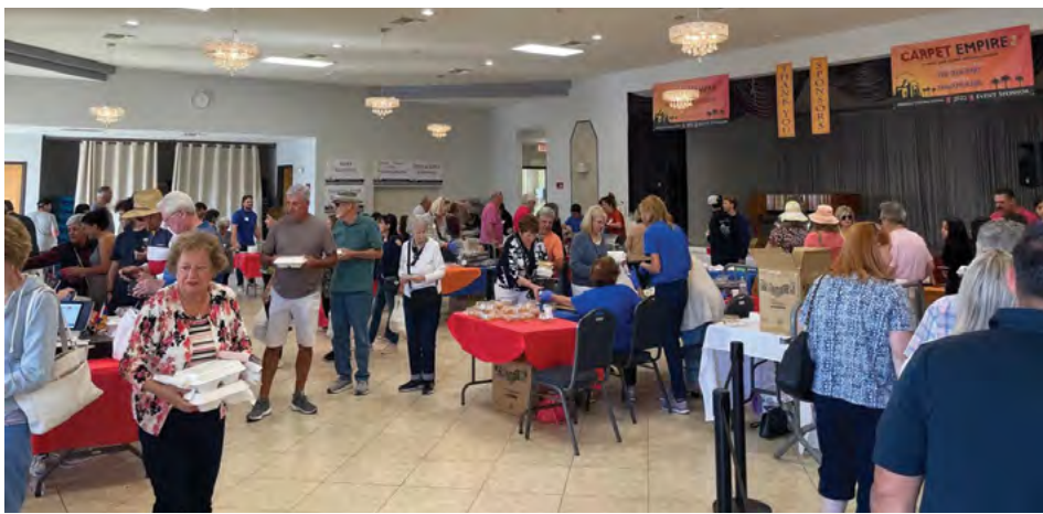
Guests grabbing food at festival. Saint Garabed Church of the Desert's Ladies Auxiliary members prepared most of the dishes