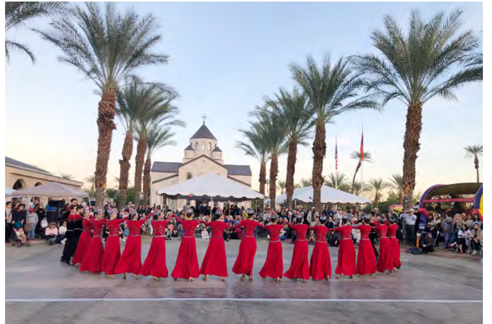
Hamazkayin Ani Dance Company