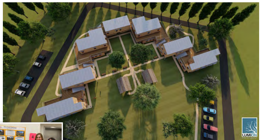
The 3 unit housing complex, designed as the white pattern of the Artsakh flag