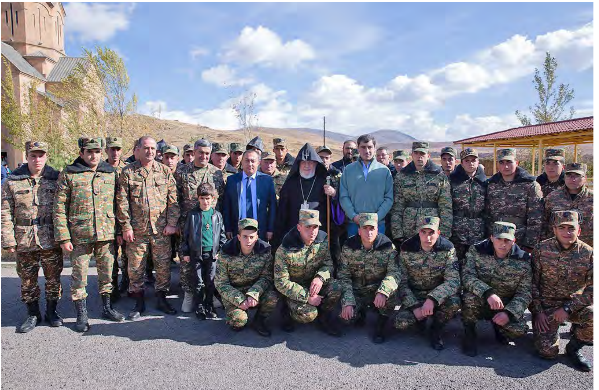
Catholicos of All Armenians Karekin II with soldiers defending the border in Jermuk