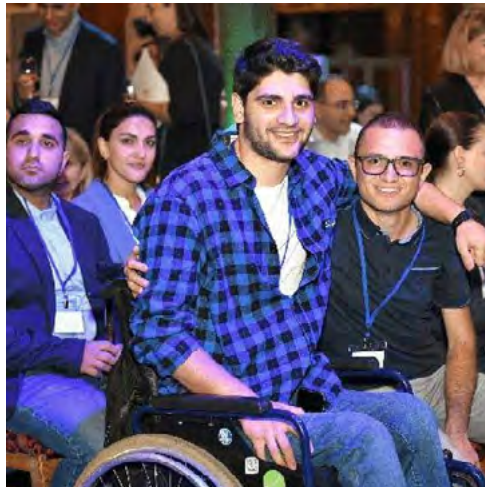
Guests at the event