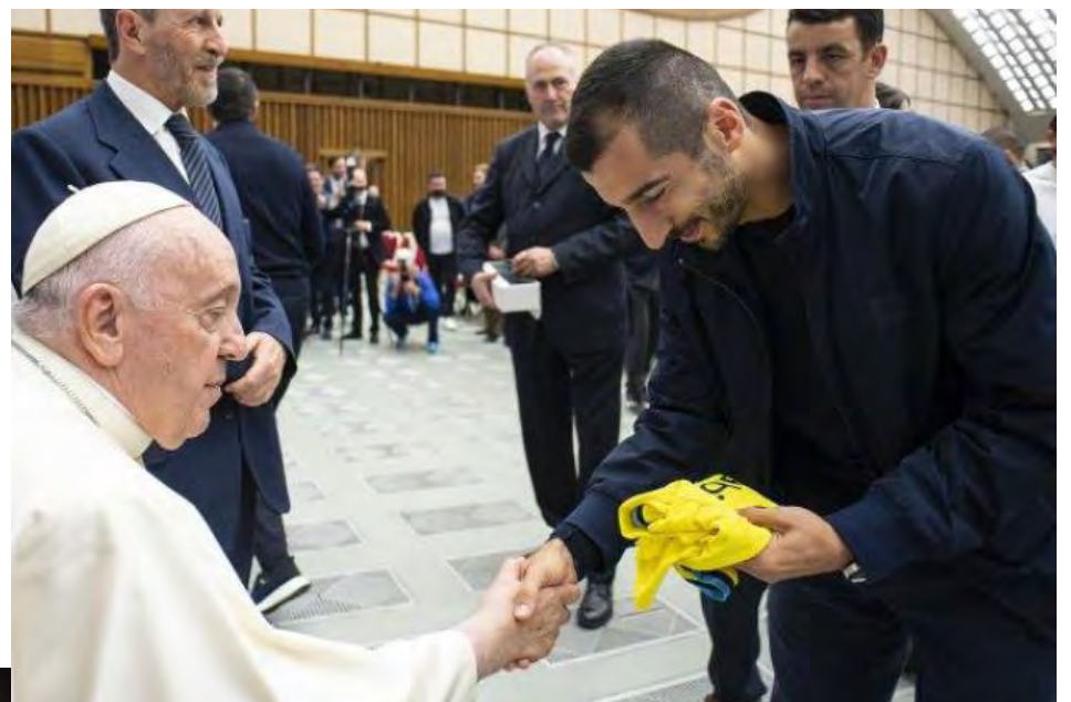
Pope Francis receives a jersey from Henrikh Mkhitaryan.