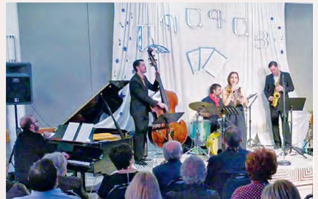
The musical performance