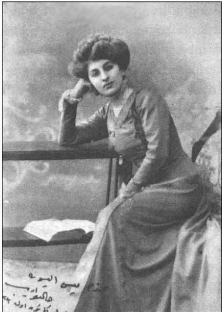
Halidé Adivar Edib

Halidé Edib was the daughter of Sultan Abdul Hamid’s secretary, Edibe Bey. She attended a Christian Greek school and was raised appreciating tolerance, according to the introduction to her Memoirs . Halidé Edib was a highly respected writer, novelist; in the intro-