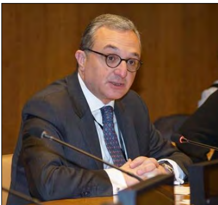
UN Ambassador Zohrab Mnatsakanyan

On September 11, 2015, after years of persistent diplomatic efforts, the Republic of Armenia succeeded in having the UN General Assembly adopt by consensus a generic reso-