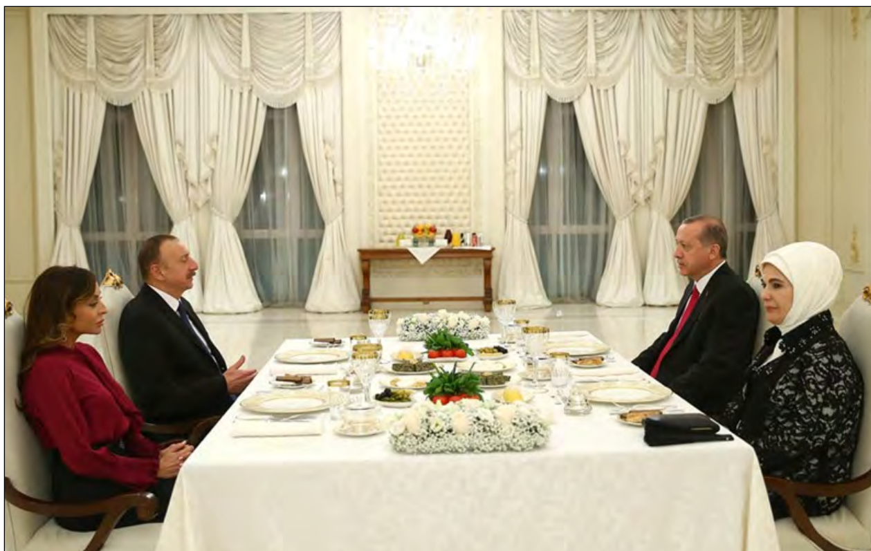
Azerbaijan's President Ilham Aliyev hosting a dinner in honor of Turkish President Recep Tayyip Erdogan's birthday on April 25, 2016

UK Prime Minister Theresa May announced last week that the National Crime Agency will investigate the corrupt practices of the four UK companies linked to Azerbaijan. Also, several members of the Parliamentary Assembly of the Council of Europe intend to expand the existing investigation of Azerbaijan's persistent corruption schemes!