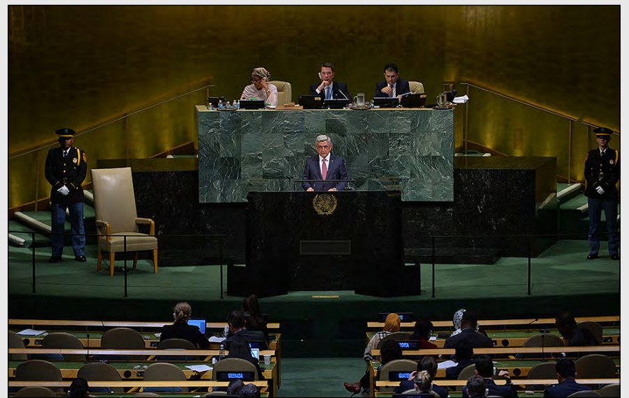
President Serzh Sargsyan speaking at the United Nations in New York

The acting team, along with some of the Armenians' favorite actors, featured internationally renowned actors from Iran, Lithuania, Greece, the United States and Russia. The composer is Serj Tankian.