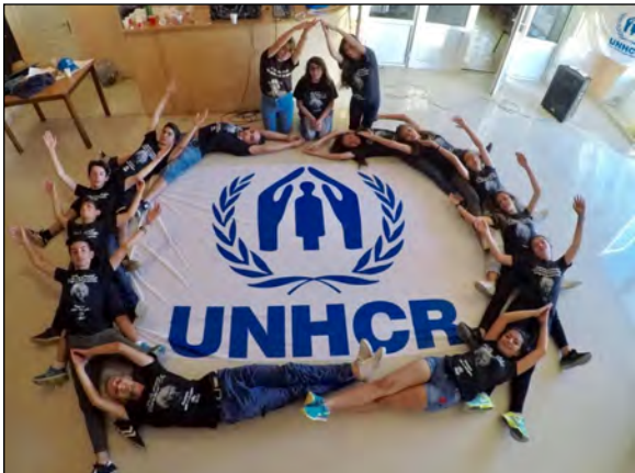
Activities at the camp included theatre, music, art, team-building and sports.

Set up by Young Men's Christian Association (YMCA) NGO Vardenis to promote social and cultural integration, the two-week-long camp also worked to improve the emotional and psychological wellbeing of displaced and refugee youth. Activities