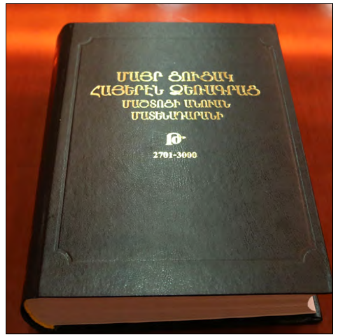
AGBU sponsors publication of Volume IX of the General Catalogue of Armenian Manuscripts of the Mashtots Matenadaran .

This initiative is one of many ways AGBU has supported the Matenadaran over the years. AGBU also financed the publication of volume III of The General Catalogue of Armenian Manuscripts of the Mashtots Matenadaran and Herald of the Matenadaran ( Banber Matenadaran ), an academic periodical. Acknowledging the need to advance Armenian Studies, AGBU also provides scholarships to doctoral students working in the Matenadaran.