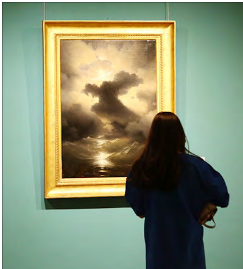
Ayvazovsky’s painting “Chaos: The Creation of the World” on display at the National Gallery of Armenia

“Goumitas had become very famous with the Anatolian songs and the music of the old Gregorian chants which he had collected during years of patient labor in Constantinople and Anatolia. He had trained a choir of the see KOMITAS, page 13