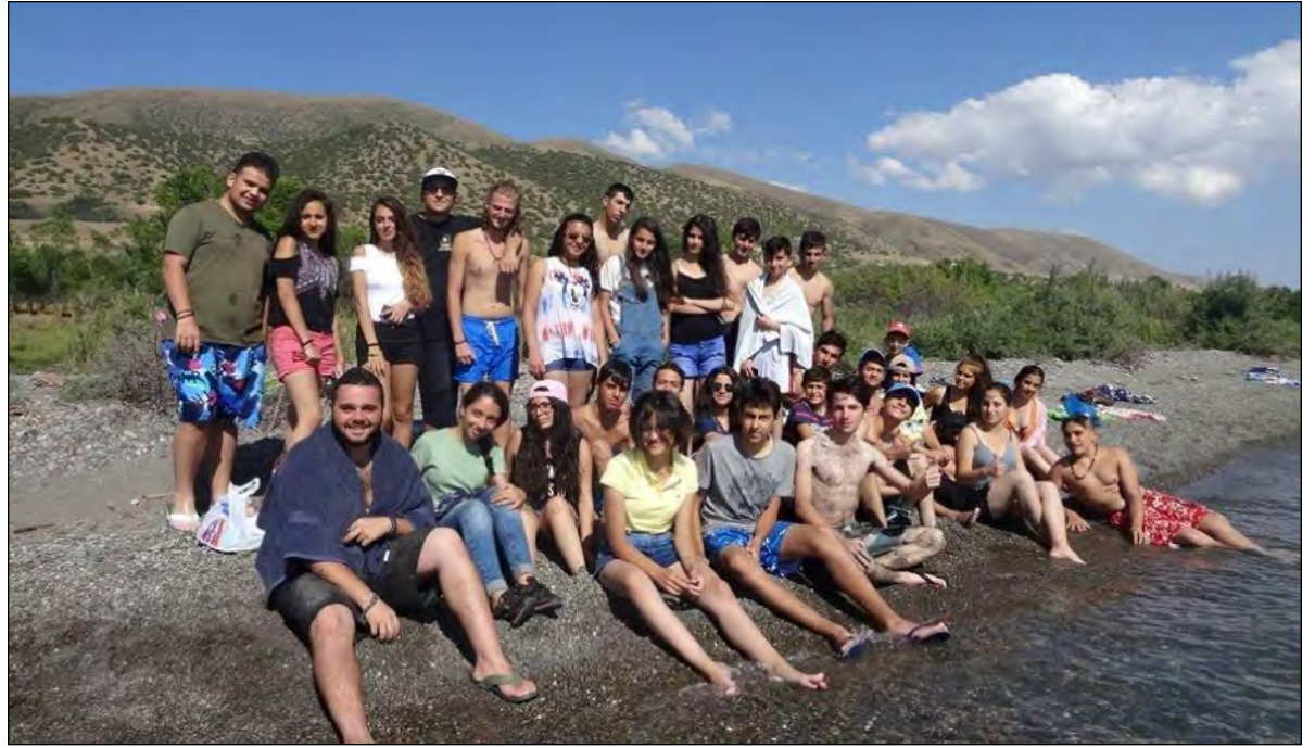
Displaced and refugee youth gathered at the spectacular Lake Sevan.

included theatre, music, art, team-building and sports.