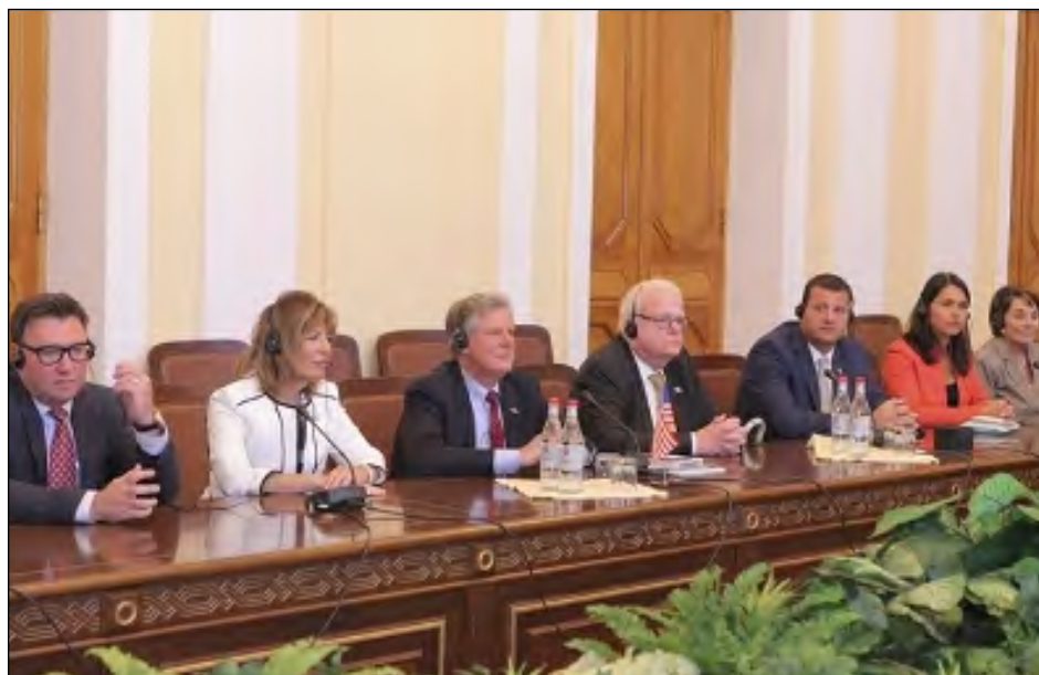
US Congressmen in Yerevan

The Deputy Speaker touched upon the steps taken in Armenia after the constitutional reforms, the works of harmonization with legislation and