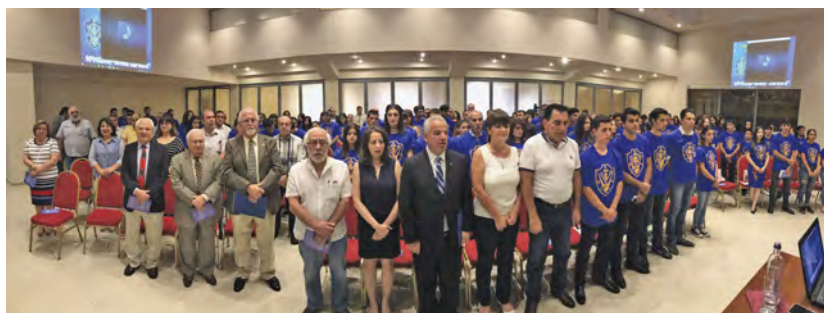
General view of the gathering

"The Venice Film Festival is one of the few unique ones that evaluates the horizons, highlights and accepts movies about human destinies, and it is not an accident that within the framework of the Italian film festival, under the high patronage of the governor of Venice Luca Zaia, 'The Last Inhabitant' had an see VENICE, page 5