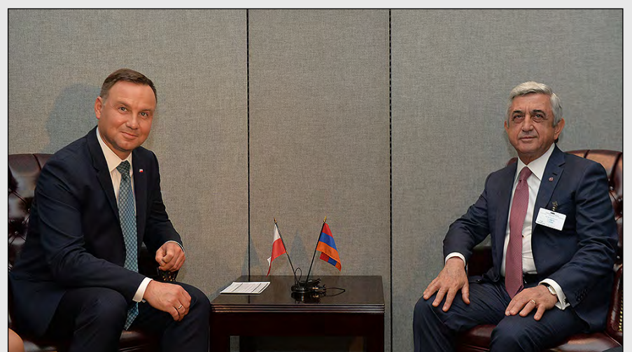
President Serzh Sargsyan, at right, with President of Poland Andrzej Duda

New York - President of Armenia Serzh Sargsyan has come to the United States of America to take part in the 72nd session of the United Nations General Assembly in New York City, where he delivered a speech on September 19. During the visit, President Sargsyan will meet with UN Secretary General António Guterres. The President of Armenia is holding other bilateral meetings in New York, and has already met with President of Poland Andrzej Duda and President of the International Red Cross.