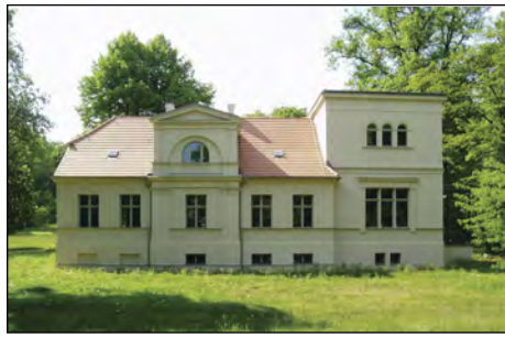
Lepsiushaus in Potsdam, Germany

The Workshop on Armenian-Turkish Scholarship (WATS) is a series of international